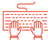
Double Data Entry

Submitting Mandated Training Documentation to Certifying Authorities is Manual & Labor Intensive